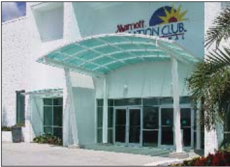
#8700 Netpark Marriott - Clearspan Canopy with custom angled columns