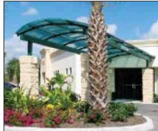
#8923 Florida Neurology Center - Clearspan Model CRP-FLR Canopy with custom flared front and custom columns