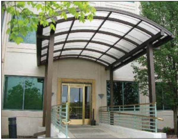
#20542 Two Conway Park - Clearspan Model CRP Canopy