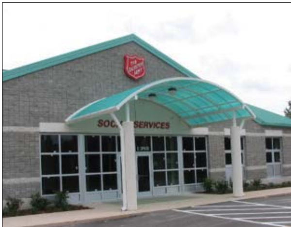
#17127 Salvation Army Service Center - Clearspan Model CRP Canopy with custom structural supports