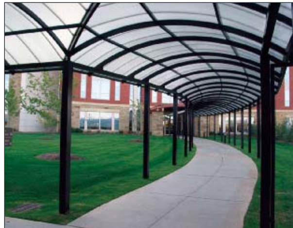
#16855 Lowes Corporate Office - Clearspan Model CRP Walkway

WWW.CPIDAYLIGHTING.COM EASY TO DESIGN • EASY TO INSTALL