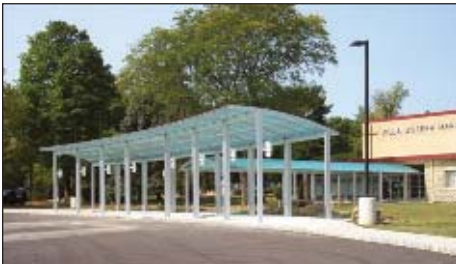
#20637 Villa Joseph Marie School - Model CRP custom walkway and drop off canopy