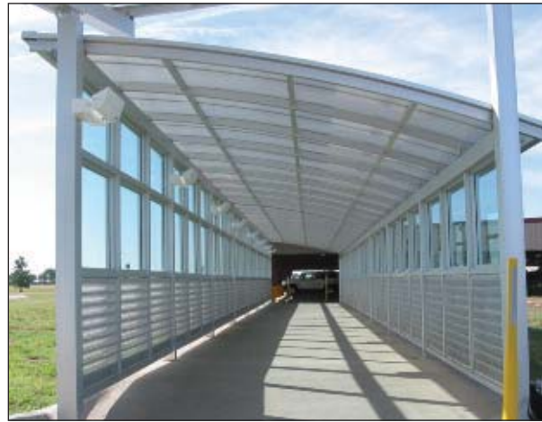
#15183 Amarillo Airport - Clearspan Model CRP Walkway with custom glass and metal louvered walls