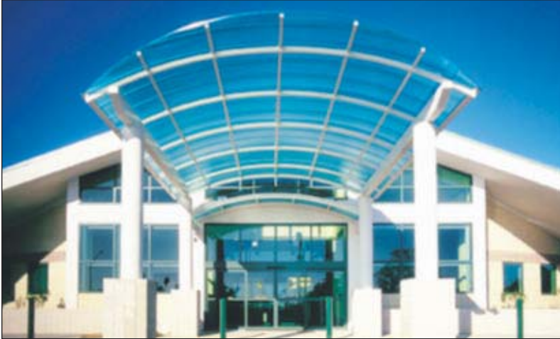
#3033 All Children's Specialty Care - Clearspan Model CRP-FLR Custom Canopy with flared front and concrete columns

Flexibility in Design... CPI's Clearspan "CRP" Canopy and Walkway system with patented Pentaglas® standing seam translucent glazing provides design flexibility that cannot be achieved with other systems. Pictured below are a variety of custom Clearspan project applications.