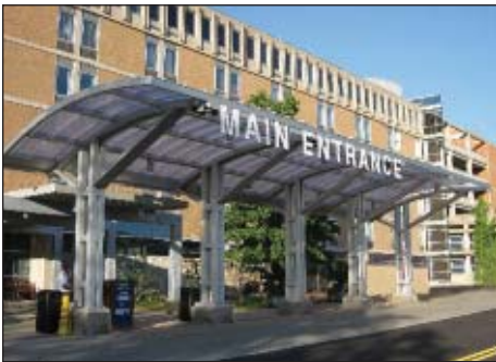
# 24359 UPMC Passavant Hospital - Model CRP custom drop off canopy

CPI Representatives are ready to serve your daylighting needs. For project assistance please call 1-800-759-6985